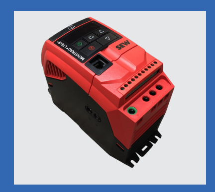
Variable Speed Rotation Drive