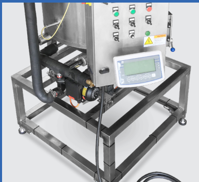
Load Cell - Batch Weight Scale Indicator