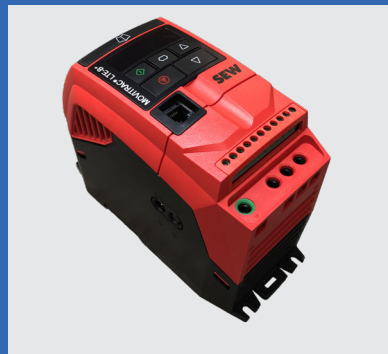
Variable Speed Mixing Function