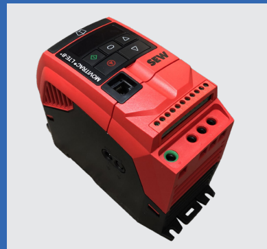
Variable Speed Mixing Function