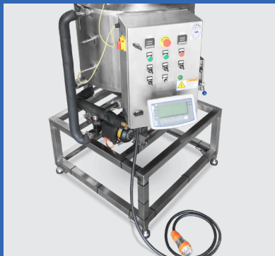
Batch Weight Scale Indicator